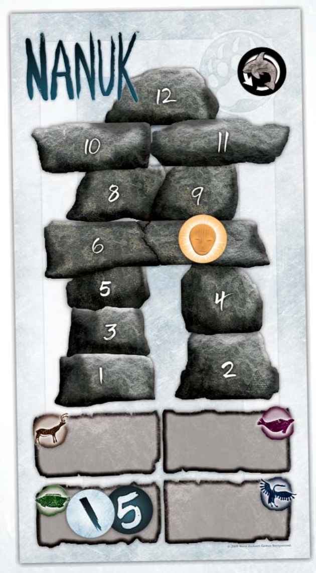
6 Fish in 7 Days

Players can raise the previous boast by any amount. For instance, a player may respond to "2 Deer in 4 days" by saying "6 Fish in 7 days."